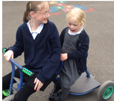
Enhancing our break and lunch provision and opportunities for the children.